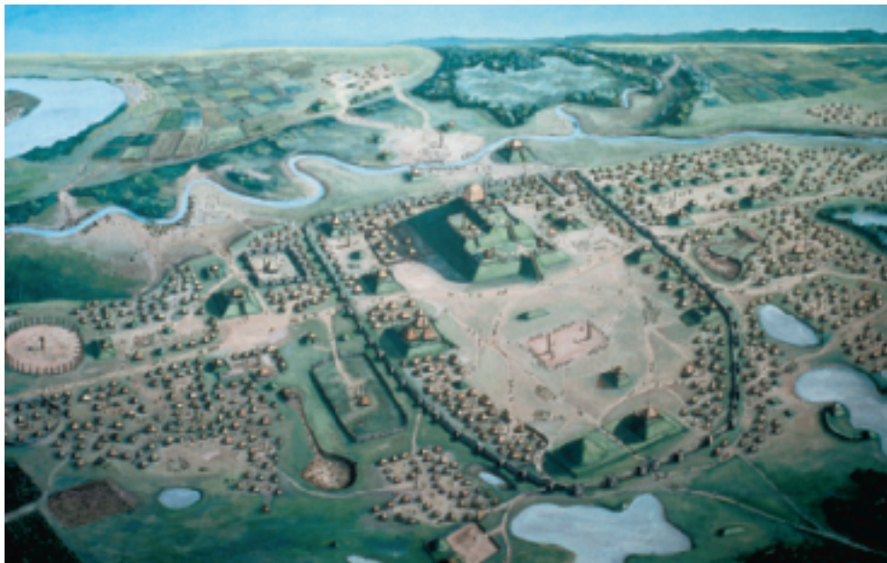
CAHOKIA An artist's rendition of the city of Cahokia circa 1100 A.D. Its great earthen mounds, constructed by the Cahokia Indians near present-day St. Louis, have endured into modern times as part of the Missouri landscape.

a profound debate over whether there is such a thing as “truth.” The world, some scholars argue, is simply a series of “narratives” constructed by people who view life in very different and often highly personal ways. “Truth” does not really exist. Everything is a product of interpretation. Not many historians embrace such radical ideas; most would agree that interpretations, to be of any value, must rest on a solid foundation of observable facts. But historians do recognize that even the most compelling facts are subject to many different interpretations and that the process of understanding the past is a forever continuing—and forever contested—process.