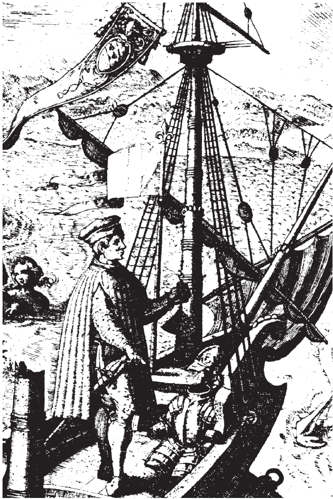
CHRISTOPHER COLUMBUS In this somewhat idealized drawing, created several years after Christopher Columbus's historic voyage to the New World, Columbus stands in the bow of his ship, a suit of armor ready at his feet, approaching a shore in the New World that he believed was in fact part of Asia.

Isthmus of Panama), he returned to Spain believing that he had explored at least the fringes of the Far East. He continued to believe that until he died.