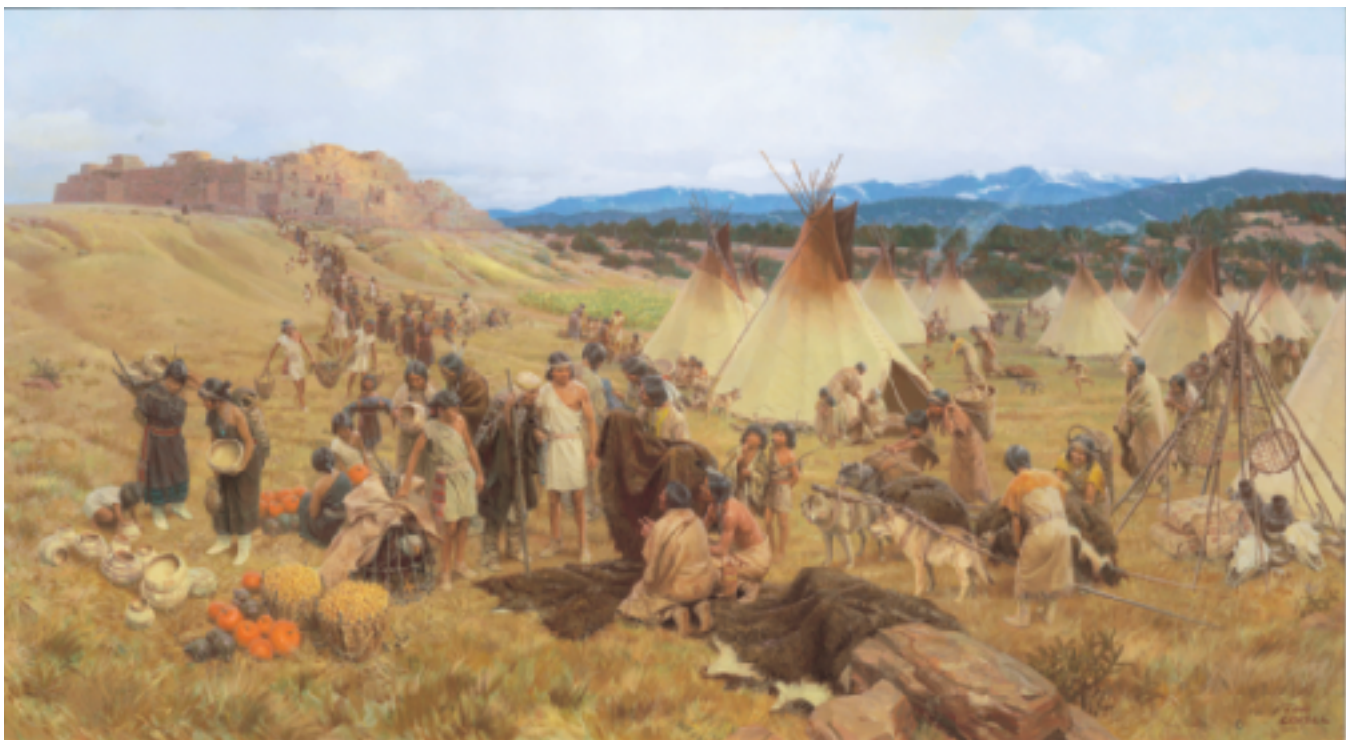
THE TRADING CENTER OF THE PUEBLOS This modern painting portrays Pecos, a trading center in the Rio Grande valley in about 1500 A.D. It was a gathering place for the sedentary Pueblos, who raised crops and made pottery, and the Plains Apaches, who hunted buffalo. At their periodic rendezvous, the tribes exchanged food and other goods.

It was, however, a colonial empire very different from the one the English would establish in North America beginning in the early seventeenth century. Although the earliest Spanish ventures in the New World had been largely independent of the throne, by the end of the sixteenth century the monarchy had extended its authority directly into the governance of local communities. Colonists had few opportunities to establish political institutions independent of the crown. There was also a significant economic difference between the Spanish Empire and the later British one. The Spanish were far more successful than the British would be in extracting great surface wealth—gold and silver—from their American colonies. But for the same reason, they concentrated relatively less energy on making agriculture and commerce profitable in their colonies. The strict commercial policies of the Spanish government (policies that the