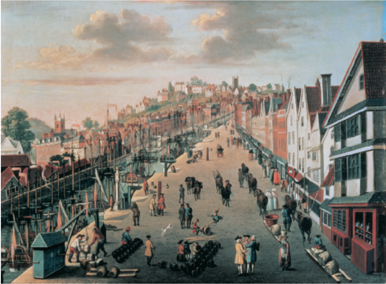
THE DOCKS OF BRISTOL, ENGLAND By the eighteenth century, when this scene was painted, Bristol had become one of the principal English ports serving the so-called triangular trade among the American colonies, the West Indies, and Africa. The lucrativeness of that trade is evident in the bustle and obvious prosperity of the town. Even earlier, however, Bristol was an important port of embarkation for the thousands of English settlers migrating to the New World. ( Docks and Quay. English School (18th Century). City of Bristol Museum and Art Gallery/The Bridgeman Art Library, London )

openly challenged some of the basic practices and beliefs of the Roman Catholic Church—until then, the supreme religious authority and also one of the strongest political authorities throughout western Europe. Luther, an Augustinian monk and ordained priest, challenged the Catholic belief that salvation could be achieved through good works or through loyalty (or payments) to the church itself. He denied the church’s claim that God communicated to the world through the pope and the clergy. The Bible, not the church, was the authentic voice of God, Luther claimed, and salvation was to be found not through “works” or through the formal practice of religion, but through faith alone. Luther’s challenge quickly won him a wide following among ordinary men and women in northern Europe. He himself insisted that he was not revolting against the church, that his purpose was to reform it from within. But when the pope excommunicated him in 1520, Luther defied him and began to lead his followers out of