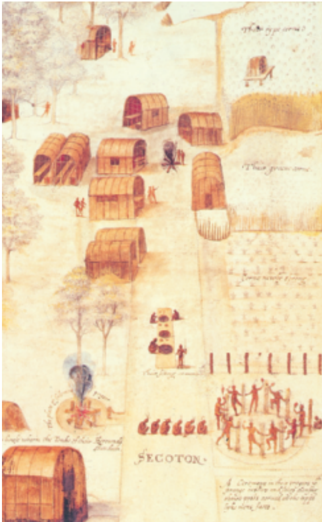
THE INDIAN VILLAGE OF SECOTON (C. 1585), BY JOHN WHITE John White created this illustration of life among the Eastern Woodland Indians in coastal North Carolina. It shows the diversified agriculture practiced by the natives: squash, tobacco, and three varieties of corn. The hunters shown in nearby woods suggest another element of the native economy. At bottom right, Indians perform a religious ritual, which White described as “strange gestures and songs.”

Christian empire there to aid in his country’s wars against the Moors of northern Africa; and he hoped to find new stores of gold. The explorations he began did not fulfill his own hopes, but they ultimately led farther than he had dreamed. Some of Henry’s mariners went as far south as Cape Verde, on Africa’s west coast. In 1486 (six years after Henry’s death), Bartholomeu Dias rounded the southern tip of Africa (the Cape of Good Hope); and in 1497–1498 Vasco da Gama proceeded all the way around the cape to India. In 1500, the next fleet bound for India, under the command of Pedro Cabral, was blown westward off its southerly course and happened upon the coast of Brazil. But by then another man, in the service of another country, had already encountered the New World.