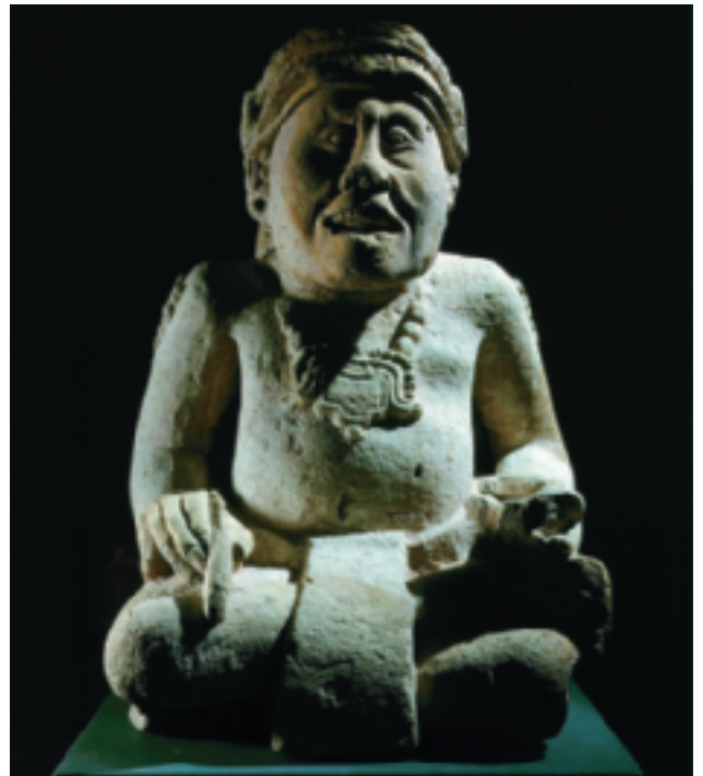
MAYAN MONKEY-MAN SCRIBAL GOD The Mayas believed in hundreds of different gods, and they attempted to personify many of them in sculptures such as the one depicted here, which dates from before 900 A.D. The monkey gods were twins who took the form of monkeys after being lured into a tree from which they could not descend. According to legend, they abandoned their loincloths, which then became tails, which they then used to move more effectively up and down trees. The monkey-men were the patrons of writing, dancing, and art.

Eskimos of the Arctic Circle fished and hunted seals; their civilization spanned thousands of miles of largely frozen land, which they traversed by dogsled. The