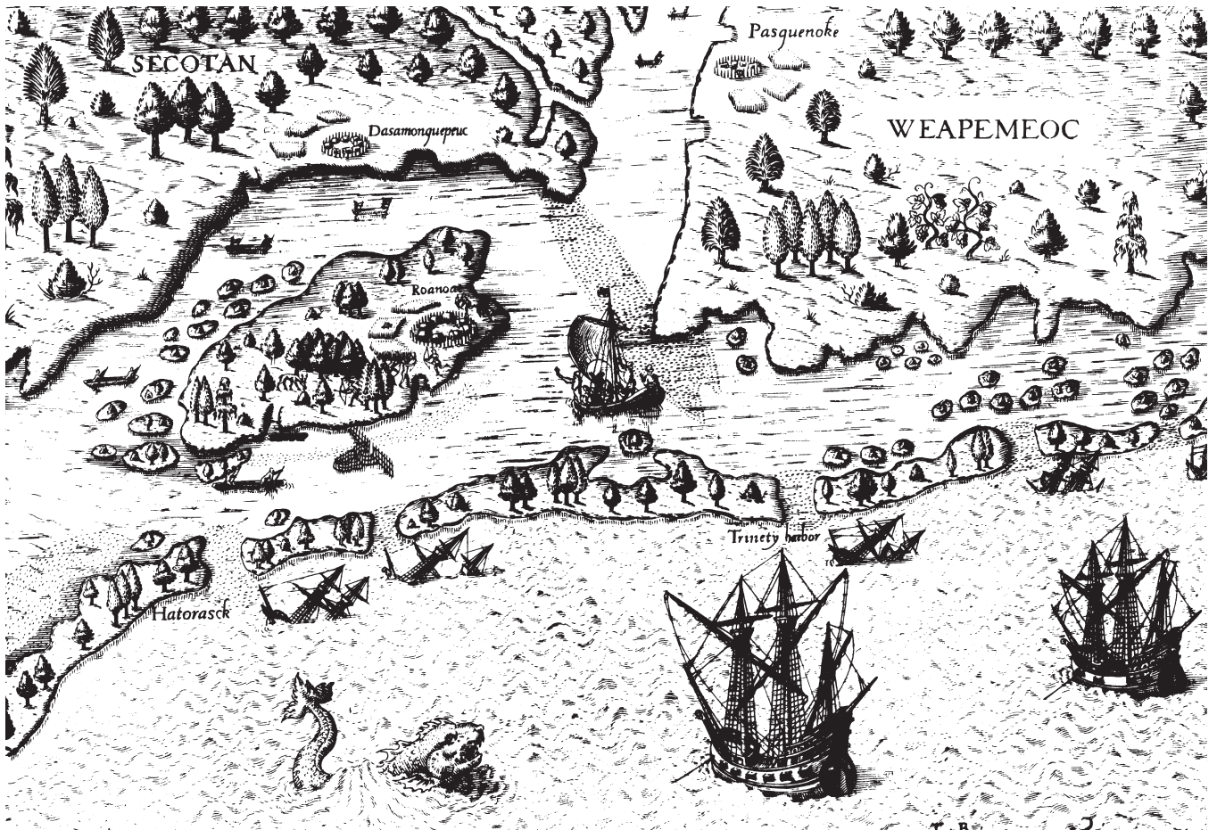
ROANOKE A drawing by one of the English colonists in the ill-fated Roanoke expedition of 1585 became the basis for this engraving by Theodore DeBry, published in England in 1590. A small European ship carrying settlers approaches the island of Roanoke, at left. The wreck of several larger vessels farther out to sea and the presence of Indian settlements on the mainland and on Roanoke itself suggest some of the perils the settlers encountered.

itary outpost that might eventually grow into a profitable colony. But a storm sank his ship, and he was lost at sea.