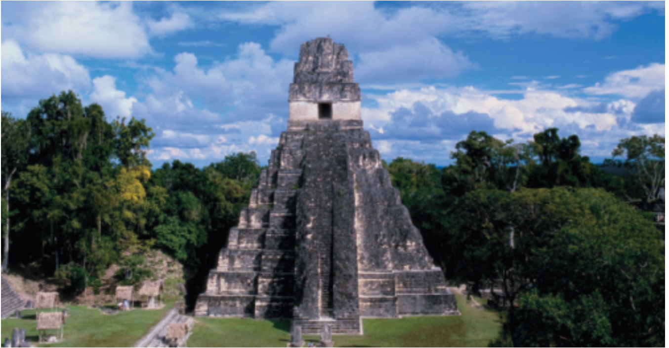
MAYAN TEMPLE, TIKAL Tikal was the largest city in what was then the vast Mayan Empire, which extended through what is now Mexico, Guatemala, and Belize. The temple shown here was built before 800 A.D. and was one of many pyramids created by the Mayas, only a few of which now survive.

blood-letting and other mostly nonfatal techniques, the Mexica believed that the gods could be satisfied only by being fed the living hearts of humans. As a result, they sacrificed people—largely prisoners captured in combat—on a scale unknown in other American civilizations.