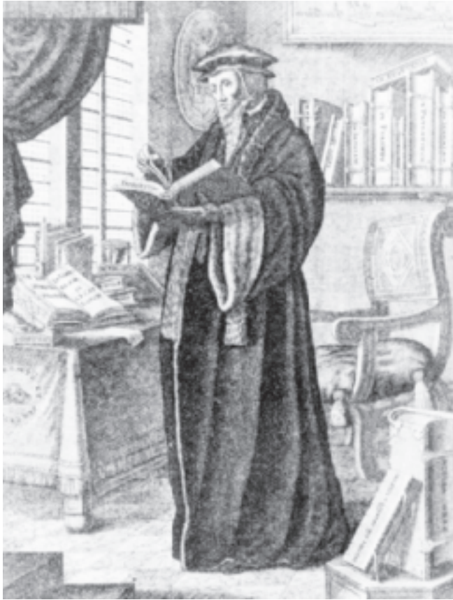
JOHN CALVIN Next to Martin Luther, John Calvin was the most important figure of the European Reformation. His belief in predestination was central to the Puritan faith of early New England.

chances of salvation. A wicked or useless existence would be a sign of damnation; saintliness, diligence, and success could be signs of grace. Calvinism created anxieties among its followers, to be sure; but it also produced a strong incentive to lead virtuous, productive lives. The new creed spread rapidly throughout northern Europe and produced (among other groups) the Huguenots in France and the Puritans in England.