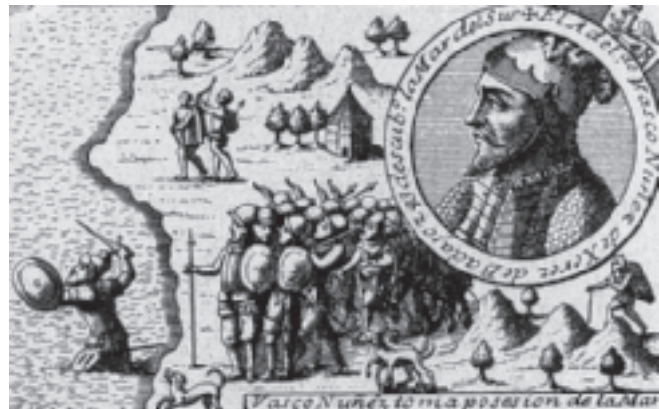
BALBOA DISCOVERING THE PACIFIC The Spanish historian Herrera created this engraving to commemorate Vasco de Balboa's discovery of the Pacific Ocean, which he encountered after fighting his way across the Isthmus of Panama. Balboa's contemporaries called the Pacific "El Mar del Sur," the "South Sea."

Renaissance Europe. But Columbus was also a deeply religious man, even something of a mys-