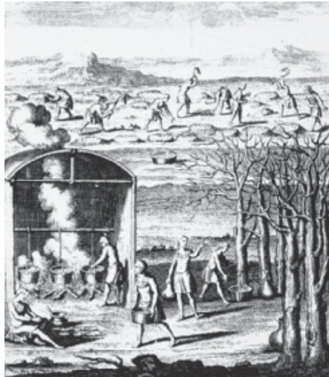
IROQUOIS WOMEN This 1734 French engraving shows Iroquois women at work in a settlement somewhere in what is now upstate New York. In the foreground, women are cooking. Others are working in the fields. Men spent much of their time hunting and soldiering, leaving the women to govern and dominate the internal lives of the villages. Property in Iroquois society was inherited through the mother, and women occupied positions of great honor and authority within the tribes.

centralized nation-states, with national courts, national armies, and—perhaps most important—national tax systems. As these ambitious kings and queens consolidated their