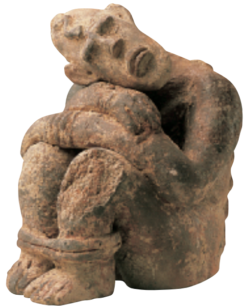
SCULPTURE OF DJENNÉ Many of the Africans forcibly exported from their homes to America in the seventeenth and eighteenth centuries were natives of Mali, the seat of an ancient east African civilization. This terra cotta sculpture, discovered in the 1940s, dates from between 600 and 900 years ago. It may be an image of an ancestor created for use in a family shrine. ("Seated Prisoner," 11th/16th Century, Djenne, Founders Society Purchase, Robert H. Tannabill Foundation Fund.)