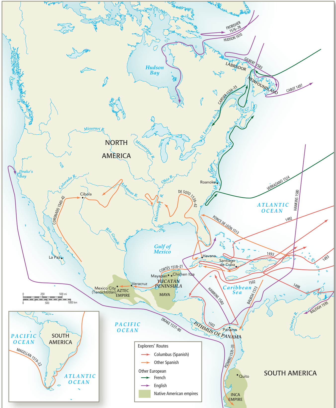
EUROPEAN EXPLORATION AND CONQUEST, 1492–1583 This map shows the many voyages of exploration to and conquest of North America launched by Europeans in the late fifteenth and sixteenth centuries. Note how Columbus and the Spanish explorers who followed him tended to move quickly into the lands of Mexico, the Caribbean, and Central and South America, while the English and French explored the northern territories of North America. ♦ What factors might have led these various nations to explore and colonize these different areas of the New World?

For an interactive version of this map, go to www.mhhe.com/brinkley13ech1maps