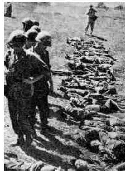
My Lai Massacre