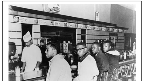
Woolworth Lunch Counter then & now