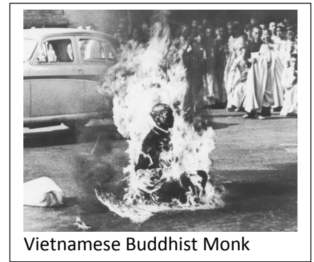
Vietnamese Buddhist Monk